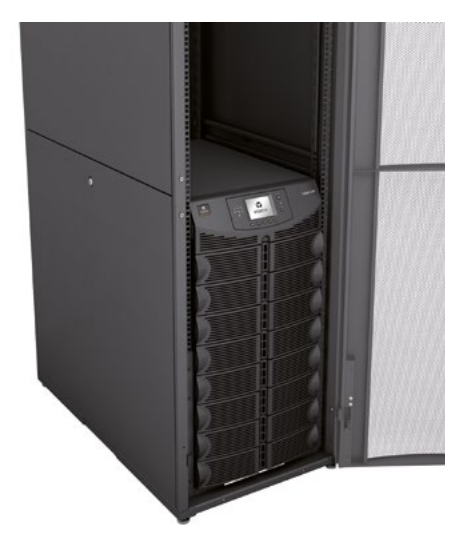
The Liebert APS UPS can be installed on raised floors, traditional flooring, or in rack enclosures.

Vertiv™ SiteScan® is a centralized site monitoring system which ensures maximum visibility and availability of critical operations. Vertiv SiteScan Web allows users to monitor and control virtually any piece of critical support equipment. Its features include real-time monitoring and control, data analysis, trend reporting, and event management.