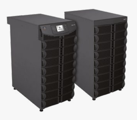
Liebert APS with matching modular battery cabinet for extended autonomy applications.

In addition, the large input voltage window capabilities further contribute to prolonging battery life and minimizing the need of transfer to battery.